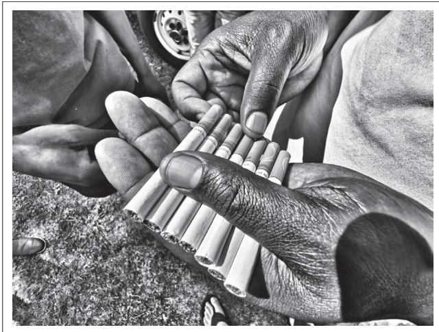
FIGURE 3: Homeless people face the same complexities as everyone else with regard to relationships, families, health and social issues. Fear, stress, uncertainty and being overwhelmed are natural things to need help with.