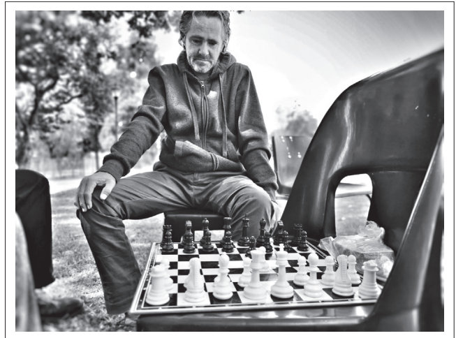
FIGURE 2: From the outside looking in, some life choices people make appear to be unhealthy or unwise. Still, they have the right to make their own choices. Basic human dignity lies in the right to make your own choices.