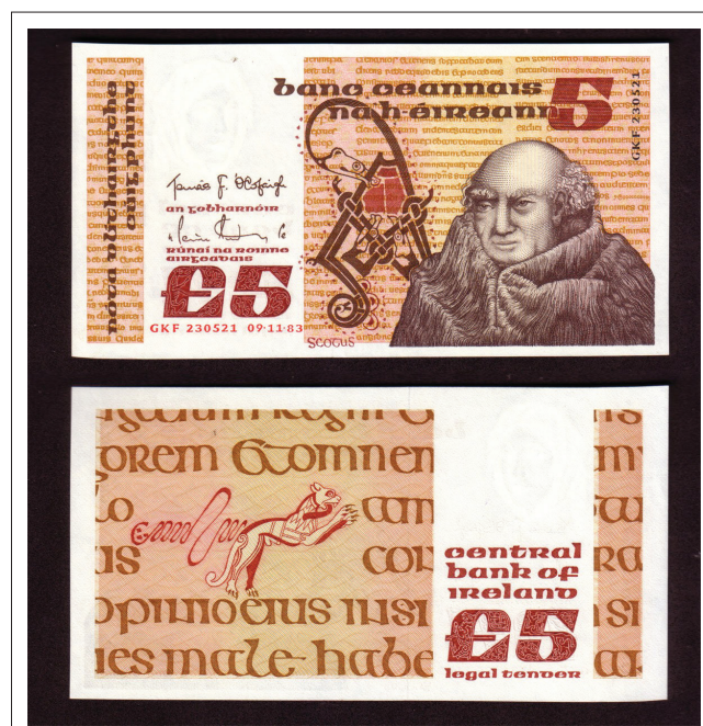
Source: Oldcurrencyexchange, n.d., O'Brien Banknote Guide: Five Pounds, Irish Banknote 'B Series' viewed n.d., from https://oldcurrencyexchange.com/2015/07/13/obrien-banknote FIGURE 1: Scotus, Central Bank of Ireland's £5, in use from 1976 to 1993. 12

paintings of Eriugena were produced after 1225, graphics from the first copies of manuscripts of the Periphyseon were recreated, resulting in a single, relatively realistic facial image of Eriugena, which was printed on the Central Bank of Ireland's £5 note, in use up to 1993 (Figure 1). Featuring the single word Scotus ('from Ireland'), this creative neo-reception took care that a name not mentioned, a face not seen and a voice not heard for centuries could become visible and audible in Ireland and beyond.