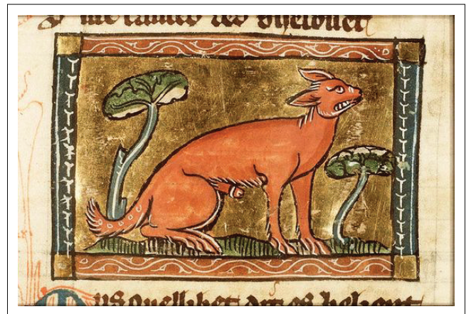
Source: Photo courtesy of Van Maerlant, J., n.d., 'Musquelibet (musk deer)', in Der naturen bloeme , 64r, Koninklijke Bibliotheek (Nederland), (KB KA 16), viewed 18 January 2021, from https://galerij.kb.nl/kb.html#/nl/dernaturenbloeme/page/65/zoom/3/lat/-65.99443315755708/ing/56.309764981269836

FIGURE 1: Musquelibet (musk deer). The illustrator emphasized the genitalia and the perfume bladder.