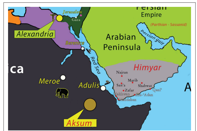
Figure 2 is a zoomed excerpt of the same map that focusses on the Horn and the Arabian Peninsula.